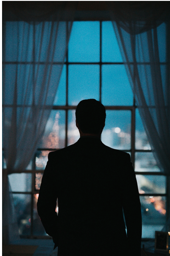
Learning about your field is a lot like being a spy.

Good spies gather intel before going out in public. They listen to the conversation stream, observe, practice. Then once they're out in the field, they fake it 'till they make it. As they go, they learn the tricks and language that bring them to be accepted into a group. In fact, spying and writing are so similar that some of the world's best writers were spies and some of the best spies became writers (see Ernest Hemingway, John Le Carre, Ian Fleming, and W. Somerset Maugham, for example).