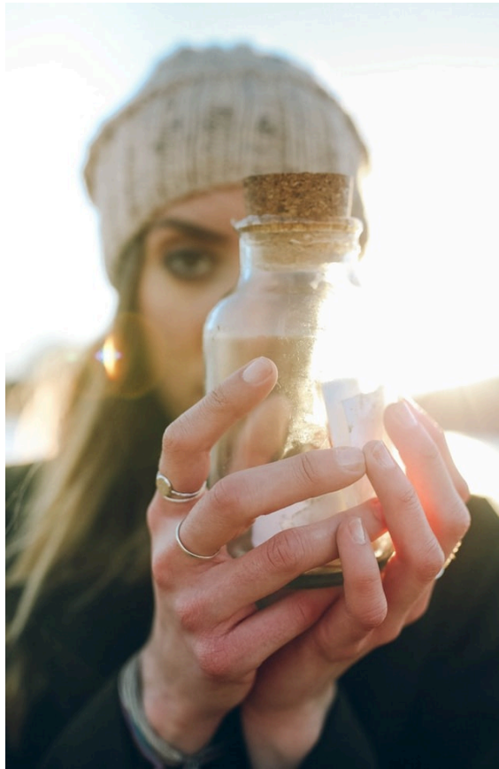
A message in a bottle: probably not the best format for a letter of recommendation.

Many of these agreed-upon shortcuts have now turned into their own Genres or expected ways of formatting a document. For example, if you ask your professor to recommend you to a graduate program, you expect them to write a formal letter of recommendation rather than, say, a text message or a message in a bottle. And, in fact, the formality and rigid organization of the letter of recommendation themselves signal to the audience that this is an official statement, that it should be taken much more seriously than a text message (or bottle message), and that the author has put significant thought and time into the document. The choice of genre alone is a sign to the audience of the document's context and purpose.