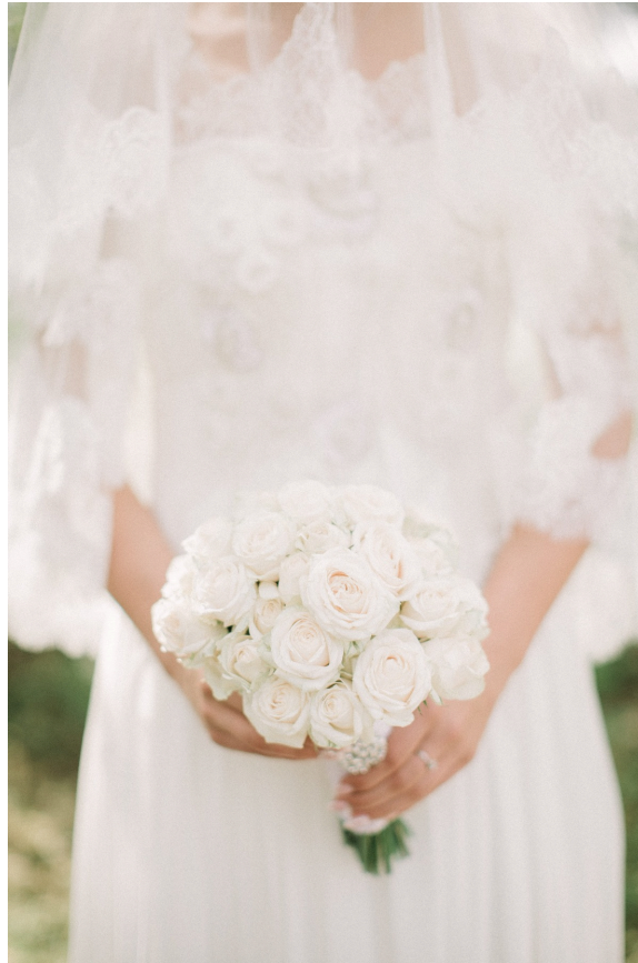
Here comes the sad bride.