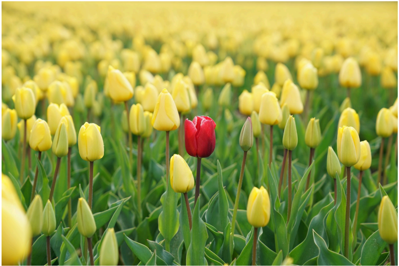
We stuck out worse than this flower. #weddingfail

Why do I bring up this painful story, you ask? Because it illustrates the point of this chapter. Remember in Chapter 1 when we talked about discourse communities and the word "shibboleth" as an indicator that someone doesn't belong to a group? You guessed it. My husband and I obviously didn't belong in the "apparently-now-it's-okay-to-wear-white-to-a-wedding" group and wished we'd been better informed. If only we'd done our homework (read the invitation and looked at a map) and learned to say the proverbial "sh" in shibboleth before we were socially obliterated that day with mean glares and long, sad sighs in our direction.