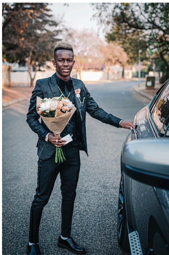
Ready for prom, not a pool party.

However, that doesn't mean that you need to lose your "voice" when you write for an academic audience; rather, you simply need to elevate your language, formalize it. Just as you wouldn't wear a tuxedo to a pool party, you wouldn't wear a swimsuit to the prom (at least, I hope you wouldn't). But no matter what you wear, you're still you.