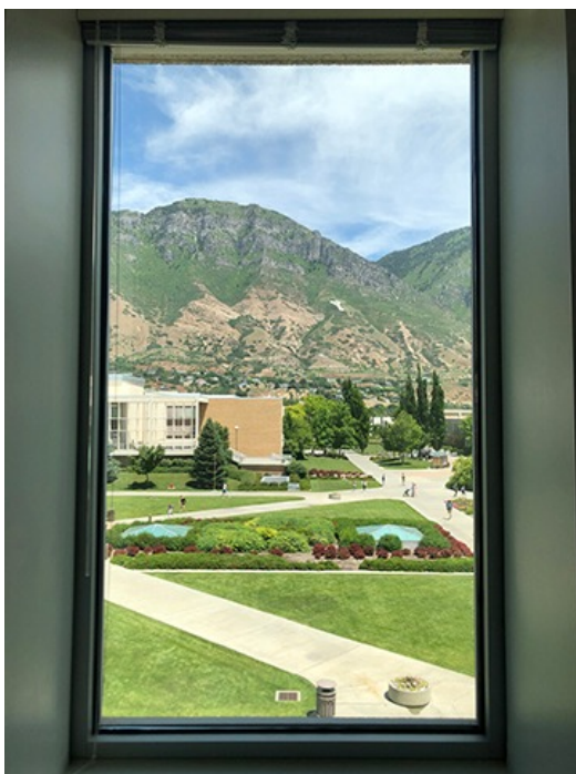
My majestic office view. #nofilter