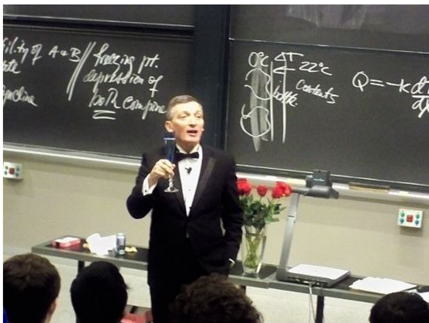
What your staunchest, most serious professor might look like at a dinner party.

Don't be like Jimmy—recognize when you're on a date! You've learned tools for analyzing your situation; use them! It pays to learn the best tools for translating your message to a general audience. It turns out even your staunchest, most boring, serious professor—you know the one who has a monotonous voice and always puts you to sleep—has to be able to explain their job to their next-door neighbor or at a dinner party or to their significant other (unless their significant other is also an expert in the same field, which means they probably have really boring, serious children. But I digress.).