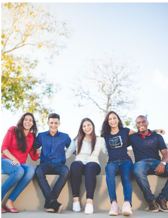
When writing this textbook, we tried to imagine what college students like you would want.

In that vein, we determined that in this textbook, you'd want us to keep the paragraphs short, include personal stories, add images and videos, incorporate lots of white space and headings, and perhaps most importantly of all, make the textbook open source and free of cost. We did all this for you! Because we care. So far, we've had very positive feedback about our choice of conversational voice and interactive elements (not to mention the fact that it's free). But if you think of ways we can improve, please feel free to tell us in the end-of-chapter surveys. The beauty of an online textbook is that we're continually revising it, so bring on the feedback!