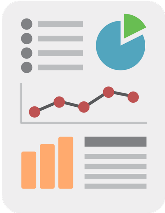
Choose clear diagrams, tables, figures, and/or images to illustrate your point. Image in Public Domain

hook or interesting fact that introduces the topic and catches their attention. Then as you proceed, make sure there's a logical progression through your points. One way to test this is to have people read it and give you feedback—find people who fit the demographics of your audience if possible.