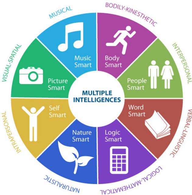
Figure 2. Multiple intelligences theory proposed by Gardner.

these eight intelligences, a person typically excels in some and falters in others (Gardner, 1983). Figure 2 describes each type of intelligence.