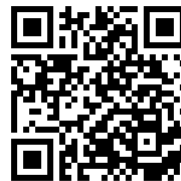
Pinnegar, S. E. (2019). Foundations of Bilingual