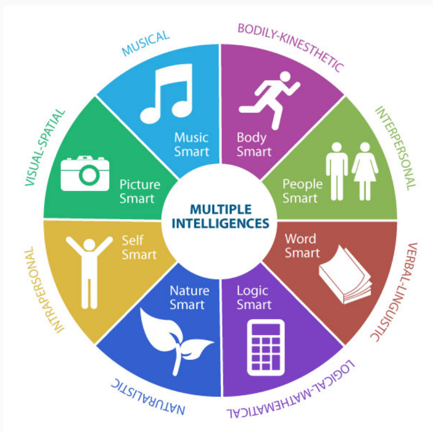
Figure 2. Multiple intelligences theory proposed by Gardner.

Multiple Intelligences Theory was developed by Howard Gardner, a Harvard psychologist and former student of Erik Erikson. Gardner's theory, which has been refined for more than 30 years, is a more recent development among theories of intelligence. In Gardner's theory, each person possesses at least eight intelligences. Among these eight intelligences, a person typically excels in some and falters in others (Gardner, 1983). Figure 2 describes each type of intelligence.