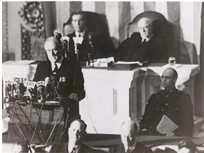
A man with a purpose: FDR delivers a speech after Pearl Harbor

Your purpose is going to shape the choices you make as a writer. If you want to report on the results of a project, you might choose to organize details in a chronological pattern since that will best convey the progress made during the project. But if you're looking to convince investors to give you some money to develop a new mobile app, you'll probably want to begin by talking about a common problem you see that your app can fix.