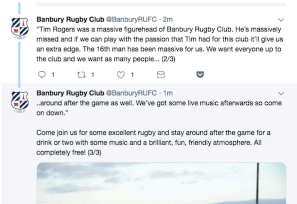
An example of a longer message posted as a series of tweets

Through time, as these unique rhetorical situations recur, a certain set of expectations about the form the message will take begins to solidify. To return to our example, after many couples follow that first, brave couple's lead, expectations (or conventions) start to emerge, leading to the recognizable genre of the engagement announcement that we see today. Certain patterns of organization might emerge as will certain phrases that help meet the needs of the context. You know you're dealing with a formalized genre when you start to see lists with help on how to write in that genre (such as this tip sheet from Brides.com for writing up your wedding announcement in the newspaper or this one from Martha Stewart about announcing your wedding on Instagram).