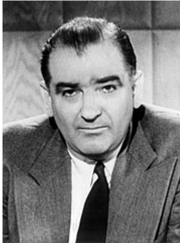
Joseph McCarthy

Emotions are powerful tools in communicating, and as such should be used carefully. Emotional appeals to an audience through specific stories and concrete details and specific word choices can evoke the proper feelings in an audience and propel them to action. (Again, some of you may be familiar with the term pathos, which the ancient Greeks used to refer to these appeals to emotion.)