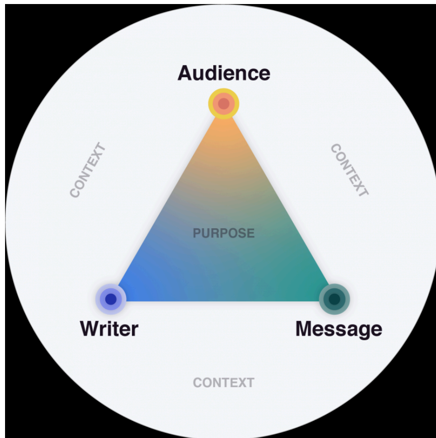
The Rhetorical Triangle

Suppose you're sitting in class and the professor starts talking about a midterm essay you have to write. Or it's near the end of the semester, you're running low on funds, and you need to ask Mom for a little extra to help see you through. Or you've graduated and your boss wants you to create an informational brochure for new employees to walk them through some common tasks on the job. In each of these cases, and so many others we encounter daily, you find yourself in what we call a "rhetorical situation" where you can put writing skills to work in communicating something meaningful. That situation has become so important to scholars of writing that we've invented several ways of thinking and talking about it. One of the most common ways configures the elements of this situation as a triangle, like the one in the image below.